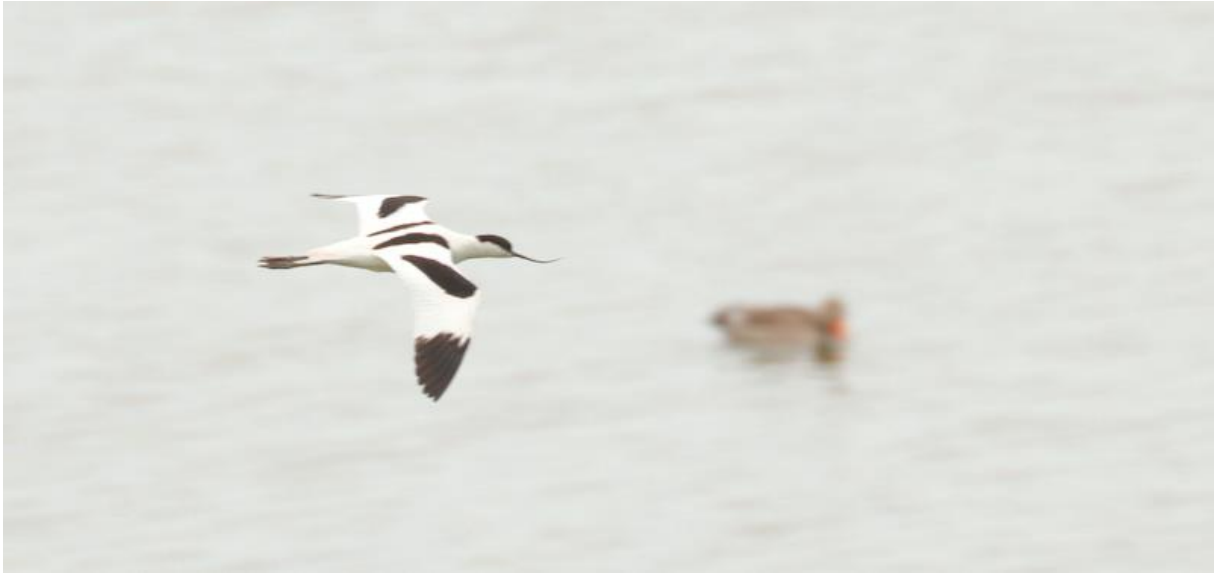
Pied avocet – Oostvaardersplassen.