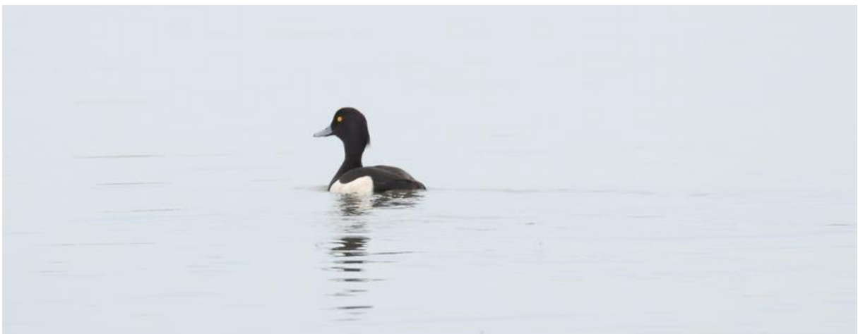
Tufted duck – Oostvaardersplassen.