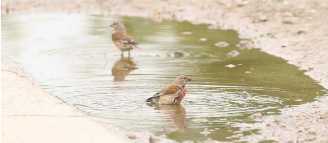
Common linnet – Oostvaardersplassen.