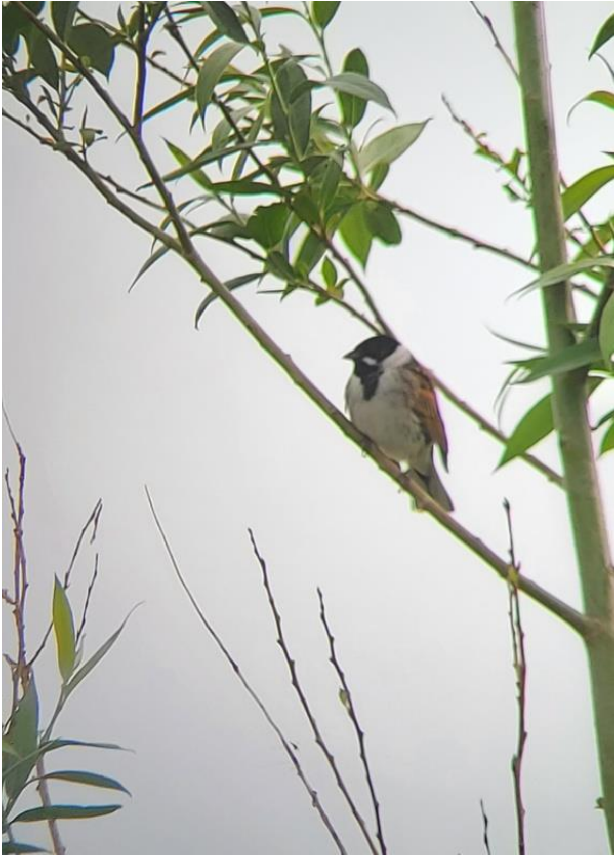
Reed bunting – Oostvaardersplassen.