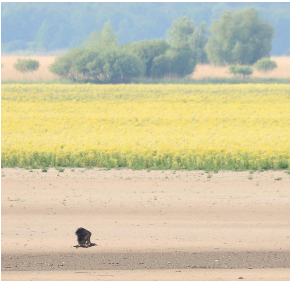
White tailed eagle – Oostvaardersplassen.