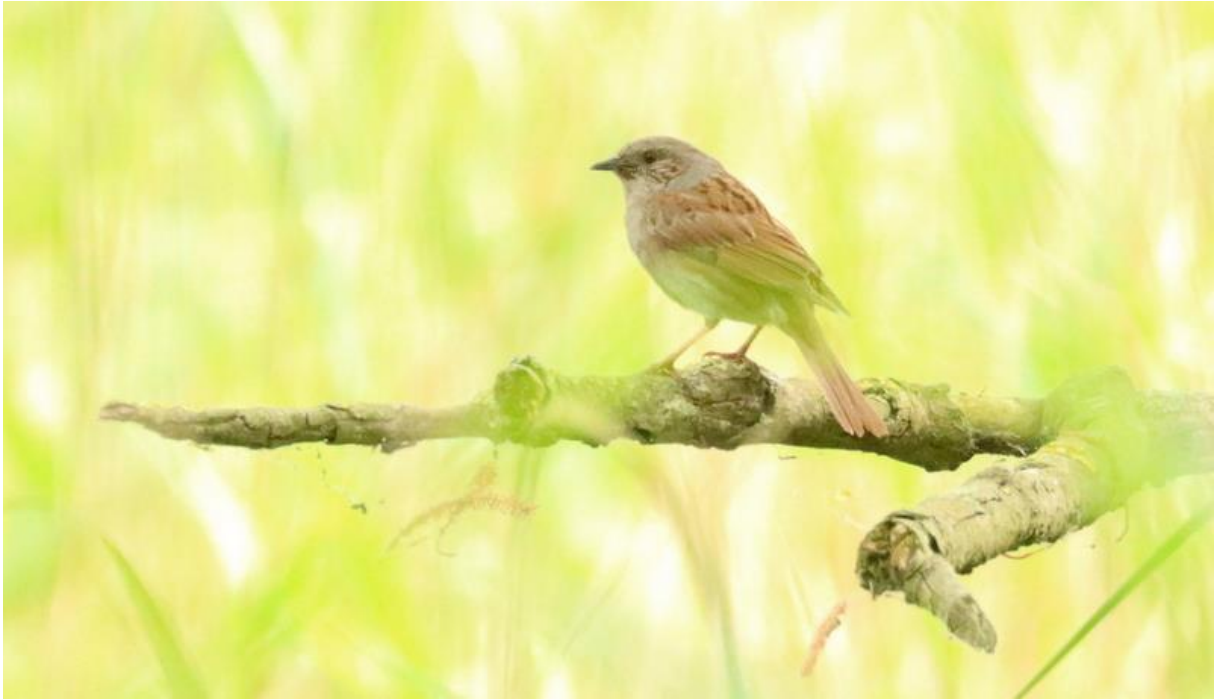
Dunnock – Oostvaardersplassen.