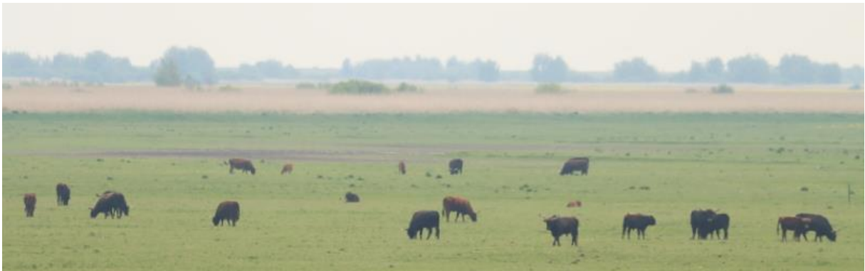
Heck cattle – Oostvaardersplassen.