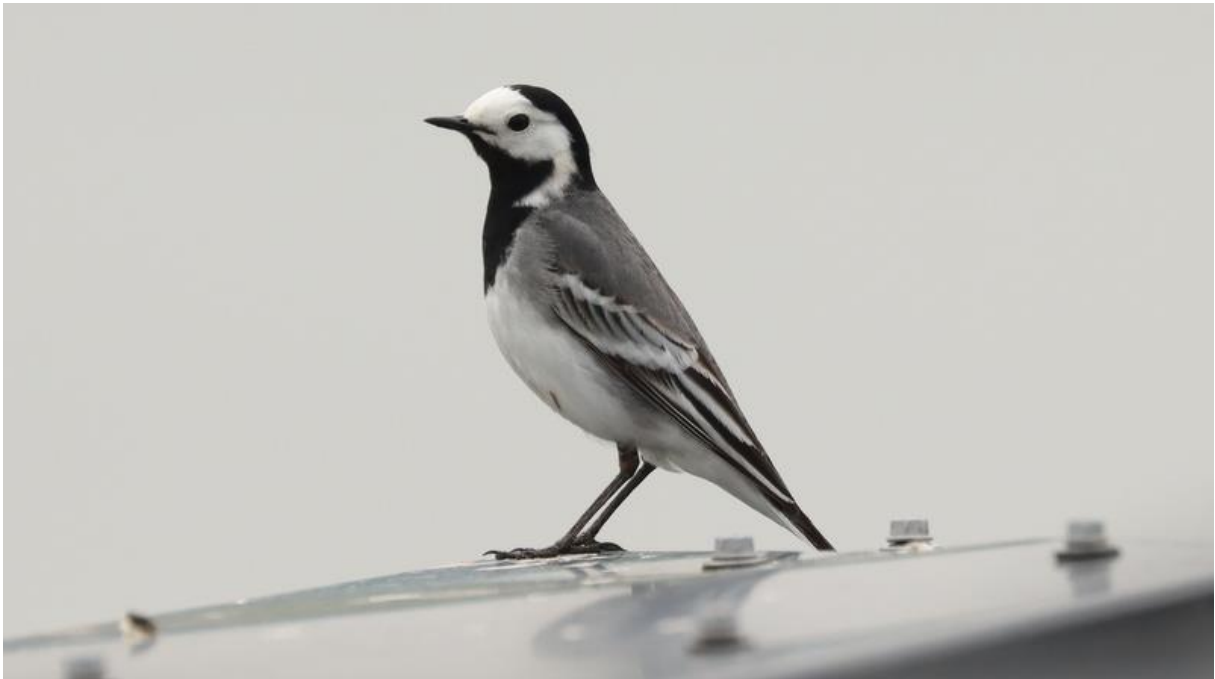
White wagtail – Oostvaardersplassen.