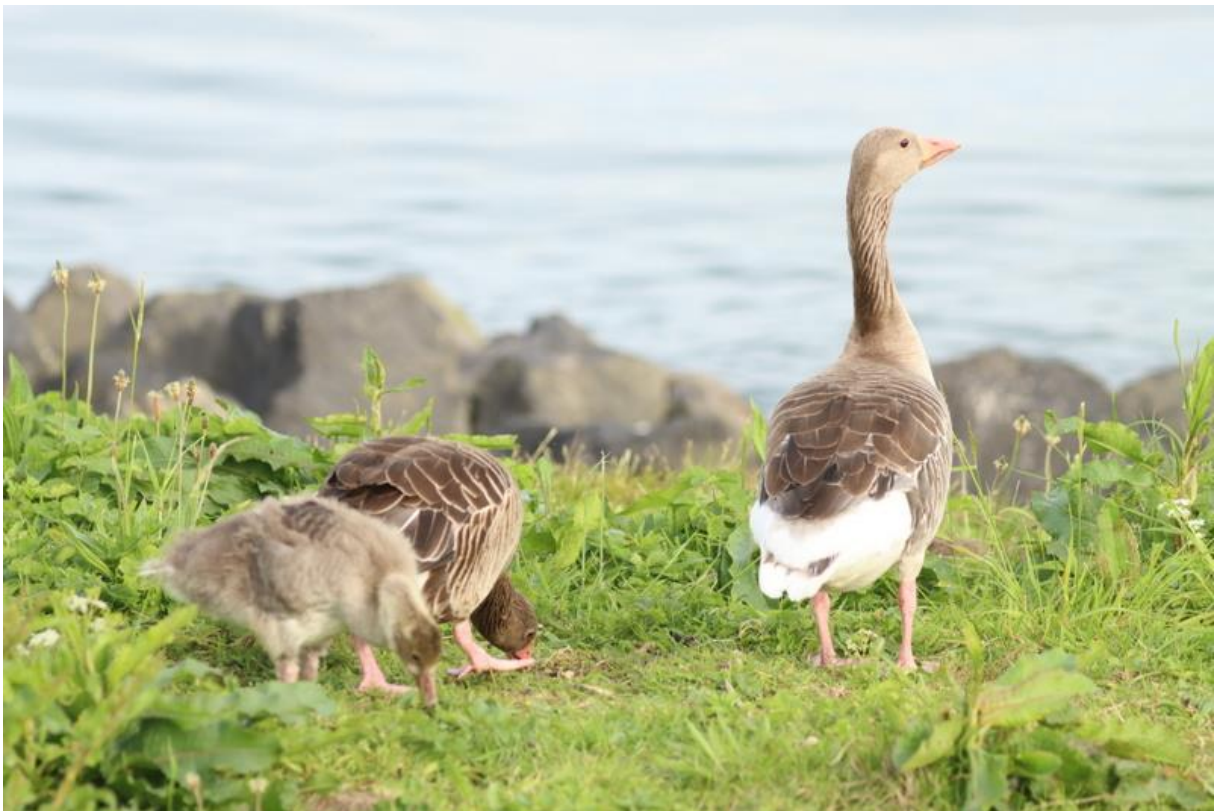
Greylag goose – Oostvaardersplassen.

On the water a pair of Common shelduck, Gadwall and Mallard. Also a White wagtail ( Motacilla alba ).