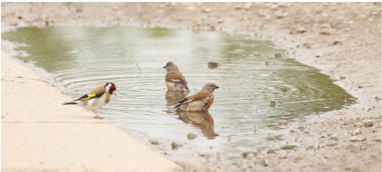
Golffinch & Common linnet – Oostvaardersplassen.