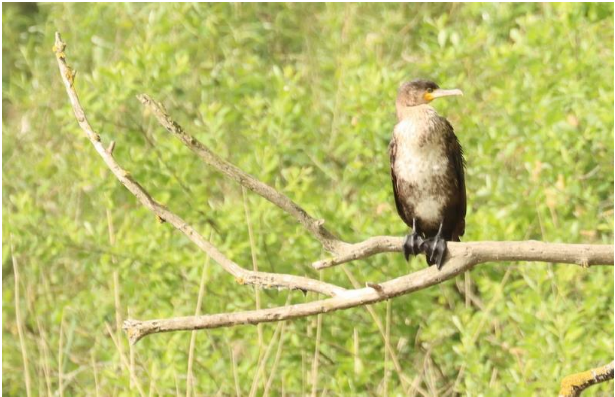
Great cormorant – Oostvaardersplassen.