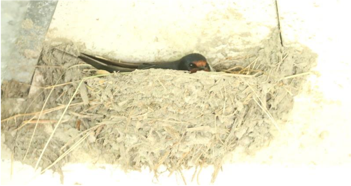
Barn swallow – Oostvaardersplassen.