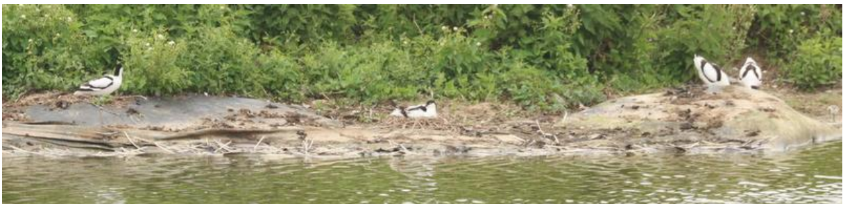
Pied avocet – Oostvaardersplassen.