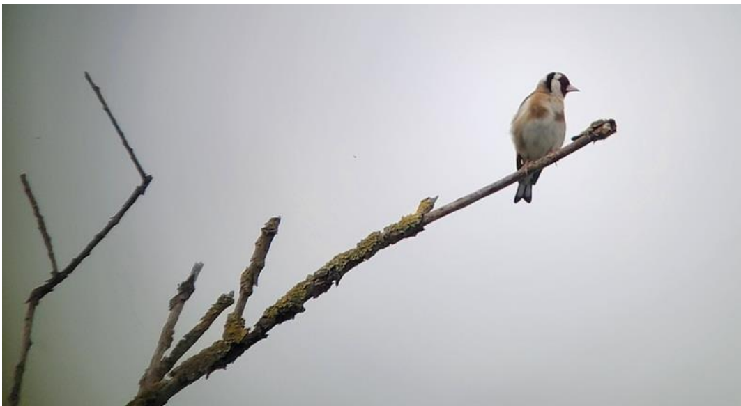
Goldfinch – Oostvaardersplassen.

We managed to catch the following species: