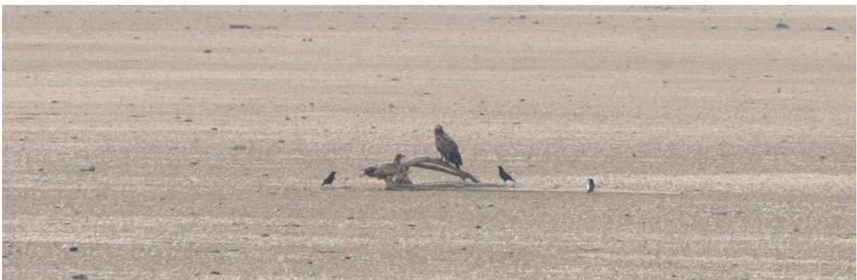
White tailed eagle – Oostvaardersplassen.