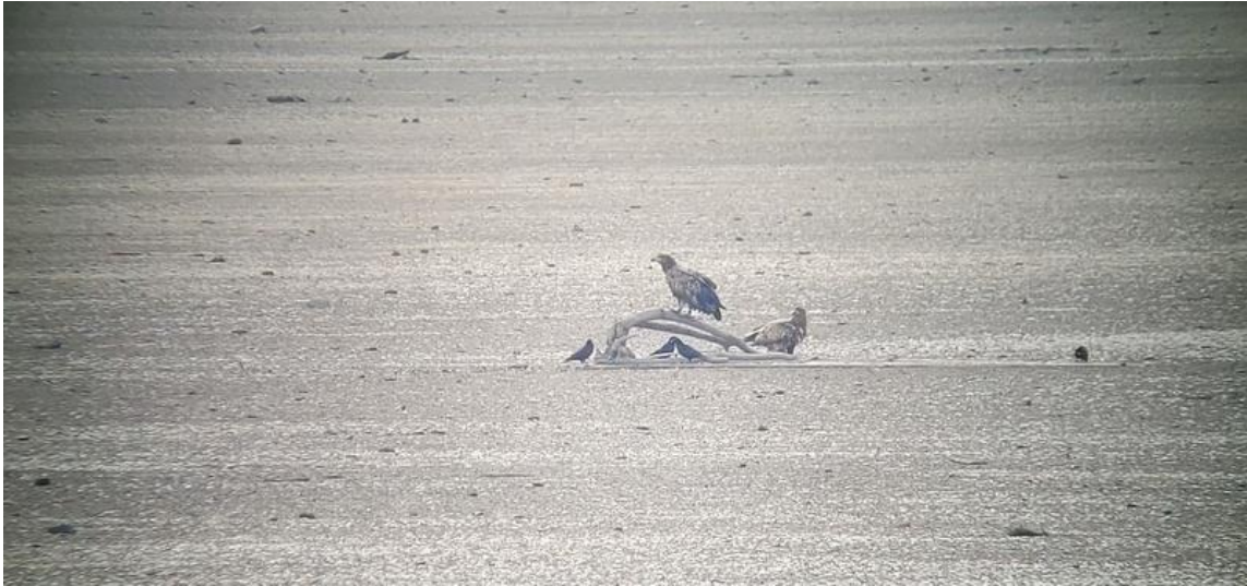
White tailed eagle – Oostvaardersplassen.

We continued our drive to the north of the reserve and stopped at a parking place. We made a walk to a bird hide. Close to the dyke we saw Greylag geese with chicks. On the lake some Great crested grebes, hunting Common terns and Lesser black backed gulls.