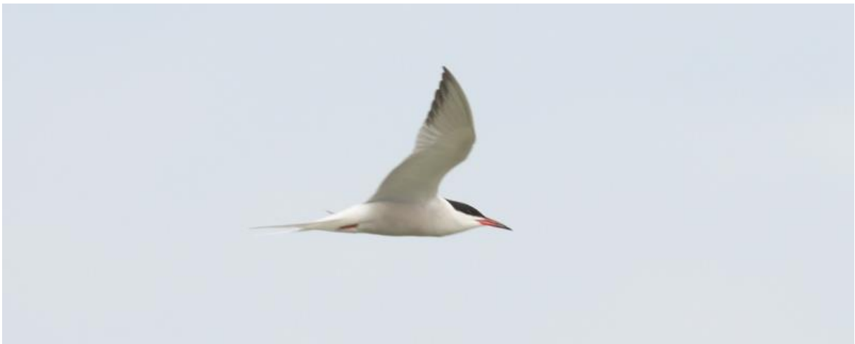
Common tern – Oostvaardersplassen.